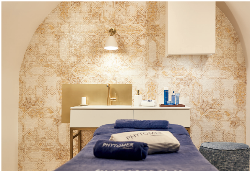
Étoile Phytomer Spa

For a shared moment of well-being, enjoy the duo cabin at the Trocadéro Phytomer Spa.